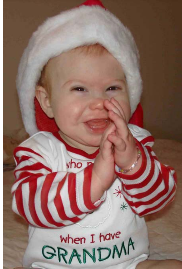
Who needs Santa when I have Grandma