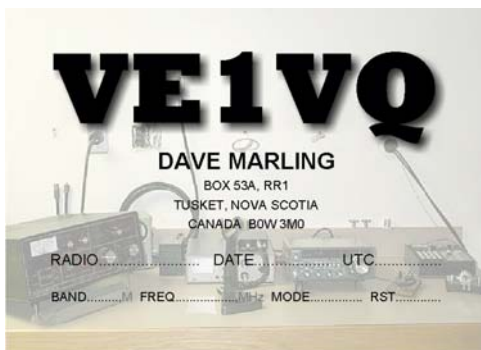
FIG. 3 – Using the same text from Fig. 2 but with a picture of the station added. The picture was “tinted” or reduced in color before being added as a background.

Many programs will allow you to import a picture into your design. Keep it subtle so that your call sign is the most prominent thing that people see.