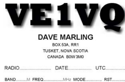
FIG. 2 – Essentially the same card as Fig. 1 but done in PRINTSHOP with some drop shadow added to the call sign to give it a dimensional effect.

An inexpensive program that makes it easy to create your own design is PRINTSHOP, in its many and various incarnations, by Broderbund . This one has been around for quite a while (now in version #22). It is shown on their website for $39.99 for either CD or internet download but you may find it for less at your local software store. I've seen older versions with a discount coupon attached. EBay has earlier versions for $30 and less (some new in box).