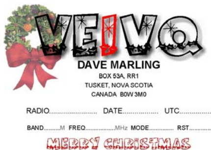
FIG. 5 – How about a QSL card for the Christmas season.

You can have special ones if you operate during the holidays.