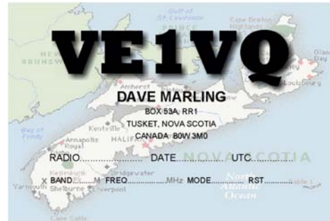
FIG. 4 – Same text again but with a map as the background.

Fonts! Fonts! And more Fonts! There are tons of sites on the net providing free fonts. Simply GOOGLE “free fonts” and browse until you find the perfect one for you. Save and install on your computer. Remember that saving every font you think you might someday use takes up memory once installed and slows down the initial computer start-up when turned on.