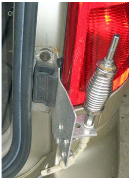
Antenna connection on N3HS's van