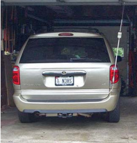
Notice the rakish antenna angle on N3HS's van