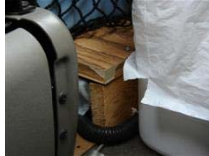
Figure 3 – Radio mounted in the box between the seats

hooking up the power cord that comes with the radio easier as they usually have a fuse at the opposite end from the rig connector and neither is easy to get through the fire wall. On my previous car I put a second power strip in the trunk when I mounted a radio there.