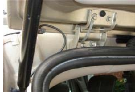
Figure 8 – View of grounding strap on the rear hatch hinge and the coax to the VHF/UHF antenna.