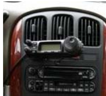
Figure 4 – Mounting position of the control head on the dash.

The control head is located on the dash in a convenient-to-reach location just above the broadcast radio using a standard mount.