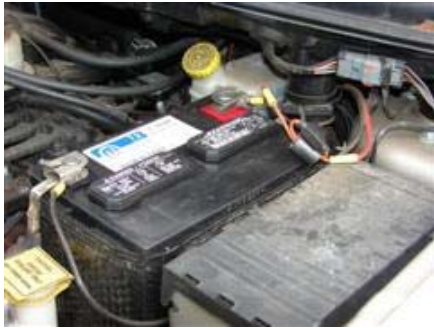
Figure 1 – Power leads connected to the battery. The positive (red) lead is wound with a couple of turns through a ferrite choke before fastening to the battery terminal.

good idea to fuse both positive and negative leads as close to the battery terminals as possible. If the vehicle's cable from the negative battery terminal comes loose at either the battery or the vehicle frame ends then starter and vehicle current will flow instead through the radio ground lead, the radio, and the coax shield to ground – Ed.]