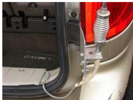
Figure 10 – View showing the coax for the HF antenna exiting the rear hatch. The grounding strap connects to the mounting bracket under the black bolt located above the rear hatch rubber shock absorber and to the left of the top of the spring.

The HF coax comes out at the end of the floor kick panel at the right side/bottom of the hatch. The lump in the heat shrink tubing is another ferrite. There is a grounding strap between the mounting bracket and the body. I used it because I wasn't sure the aluminum home made mount was/would stay grounded.