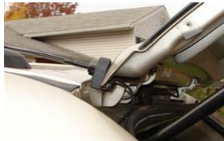
Figure 9 – Mounting of the VHF/UHF antenna on the rear hatch.

The HF coax comes out at the end of the floor kick panel at the right side/bottom of the hatch. The lump in the heat shrink tubing is another ferrite. There is a grounding strap between the mounting bracket and the body. I used it because I wasn't sure the aluminum home made mount was/would stay grounded.