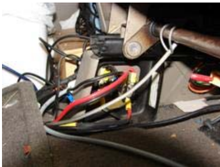
Figure 2 – Power connections under the front seat.

Robust black and red power wire is used to route the power to a terminal strip under the front seat. On other cars I have mounted the terminal strip on the upper part of the passenger side kick panel. Sure makes