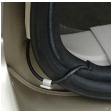
Figure 7 – Stick-on clamp for coax

The VHF/UHF antenna is a dual band antenna that is short enough to allow me into the garage without excessive interference and is mounted on the top of the hatch. The following pictures show the wire routing as well as the grounding straps for the rear hatch. The coax is routed through a flexible stick-on "conduit" available at Home Depot to keep it in place so it will not get damaged.