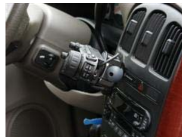
Figure 5 – Side view of the control head mounting arrangement looking toward the steering wheel.