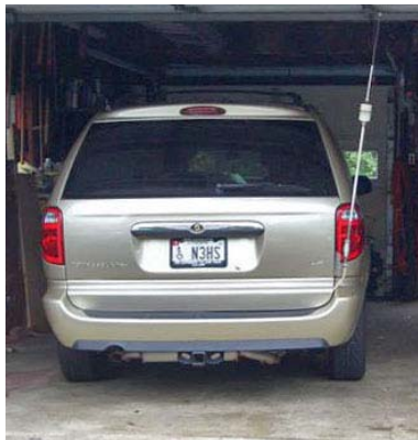
Figure 11 – Rear view of the van showing the Hustler HF antenna.

Finally here is a picture from the rear (Fig. 11). I have used various antennas with this configuration as well as other cars and I much prefer it to antennas such as the screwdriver. I have one mast, as you see, with Hustler 10, 15, 20 and 40M resonators that worked well in the past. With the low of the sunspot cycle being upon us, I have used the 20 M resonator you see in the picture as well as 40 and 80 meter ham sticks. The auto tuner allows much more flexibility in tuning round the band than a single 80 M antenna otherwise provides. The tuner also allows me to tune the 20M antenna high up so it will fit in the garage and still work on all of 20 M.