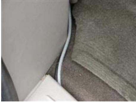
Figure 6 – Routing of the coaxial cable under the driver's side sliding door floor panel.

I have not completed the installation as I plan to hide all the excess wire behind the driver's right side kick panel that is part of the console. The antenna wires go under the driver's seat and under the kick plate on the sliding door and emerge in the back of the van.