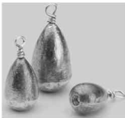
Figure 6 – Lead fishing weights. Use the 1 to 1.5 oz. versions and remember to use gloves or to wash your hands after handling. These fly and drop through tree limbs better than some old bolt you found under your car.

Next, visit the plumbing department and find a few inches of plastic or rubber tubing with an inside diameter to fit the wrist support rail and an outside diameter to more or less fit the curvature of the fishing reel mount. While you're there, pick up a couple of small adjustable hose clamps. Use a sharp knife to slit the tubing lengthwise and slip it over the rail. Clamp the reel in place with the hose clamps.