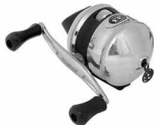
Figure 5 – Closed face (spin casting) fishing reel. Stay away from the ones under $20 unless they are on sale. Cheaper ones usually have more friction on the line as it escapes the cover, limiting the distance your shot will travel.