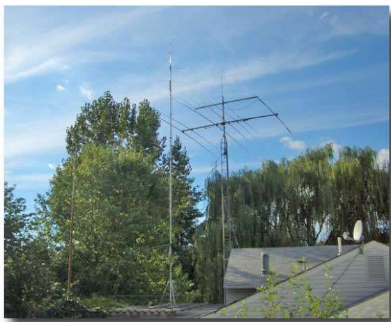
Figure 1 - N3HS's antenna farm. From right to left – a tower with two beams (Cushcraft X-7 and 50-1300 LP) with a Diamond X-50 2/440 on top. A bit left of center is a vertical antenna (AV-640 40-6m) and to the left of that, in the leaves of the tree, is a brown water pipe with another X-50. And, if you enlarge the picture, you can glimpse an 80/40 inverted-v coming down from the left side of the tower starting just under the rotor.

and at that time, the general written exam. I tried to upgrade to general several times flunking the 13 wpm code test 5 times. I had been using an Instrograph paper tape system and had apparently memorized the tape. Sure is a lot easier now with all the ways to learn code. I finally bought a used EICO 753 tri-band transceiver and used it to copy the W1AW code broadcast each night, when I was available, for a month and finally passed the 13 wpm test. I then took the advanced test and came away with an advanced license.