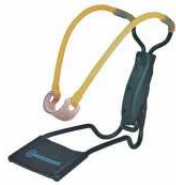
Figure 4 – Slingshot with wrist support. The support gives you more control (accuracy). You can pick these up for as little as $10.

section of your local Wal-Mart or equivalent discount store and buy a slingshot, a closed face fishing reel and a package of 1 oz. fishing weights (see the pictures below).