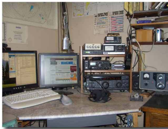
Figure 2 - Command central for N3HS

My final nine years at the Energy Department were spent as the Environment, Safety and Health officer for the Office of Basic Energy Science, a $1B basic research program. I was brought into that program to work on the problem that they were having with a small research reactor at the Brookhaven National Laboratory. We lost that one and lost a very valuable research tool because of the impossibility of communicating in a very charged political atmosphere. The final $2.5M Environmental Impact Statement was scrapped and not published for purely political reasons.