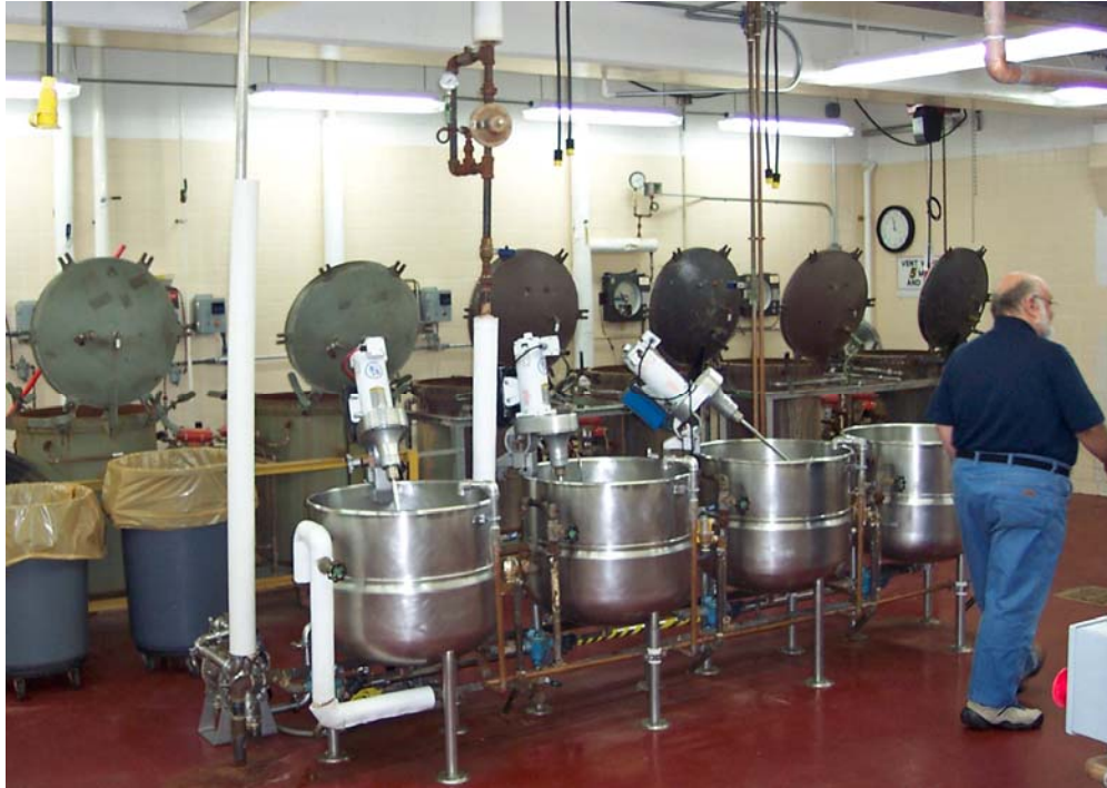
Some of the equipment at the BCS – Jeff KB3OYE not included!