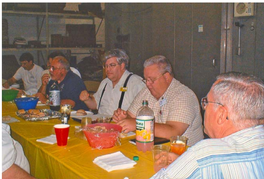
Lunch break on the right

E-mail your comments, ideas, or submissions to marane@mara.net