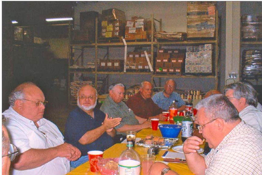
Lunch break on the left