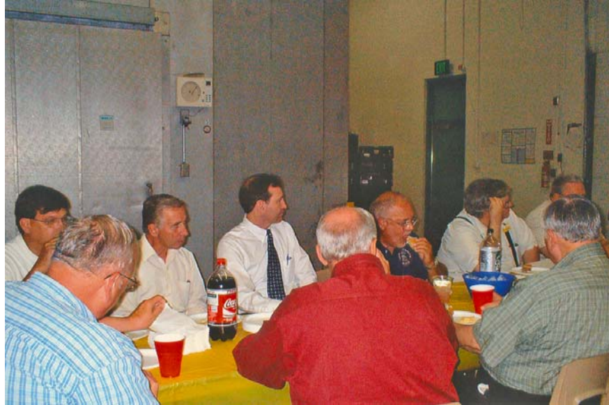
Lunch break from the other end of the dining spectrum