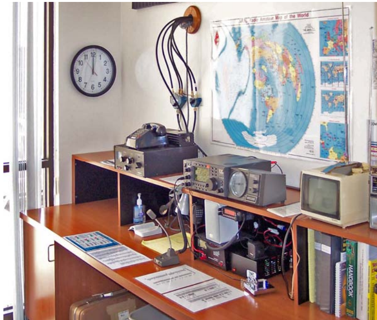
Any radio room is always a popular spot with hams. This one at the Washington DC BCS was no exception. Have you ever seen anything so disgustingly neat?